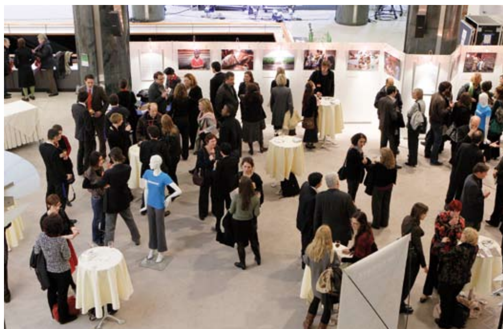
Exhibition on violence against women in DR Congo, held at the European Parliament in March 2010

No matter what, the momentum generated in 2010 – the tenth anniversary of UNSCR 1325's adoption – should be used to put pressure on states whose implementation of the resolution has been unsatisfactory so far. The European Union should take the lead in this respect and urge all its Member States to draw up comprehensive national action plans for implementing Resolution 1325. Germany, too, should abandon its obstinate attitude and develop a meaningful national action plan. The time has come to walk the talk.