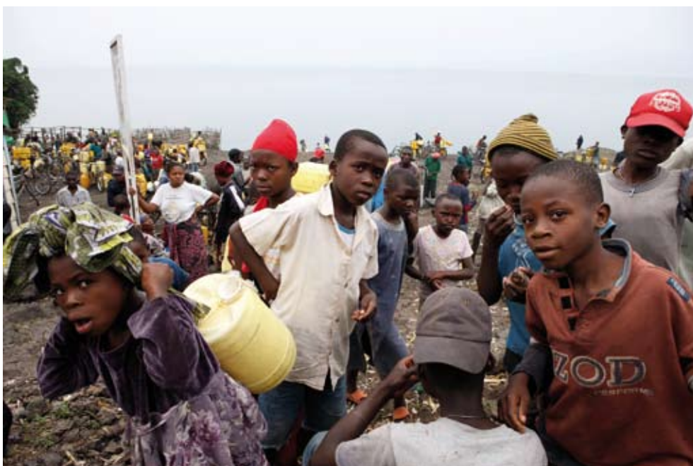
Mugunga refugee camp: there is only one access point to water in the whole camp, so water often has to be carried over many kilometres.