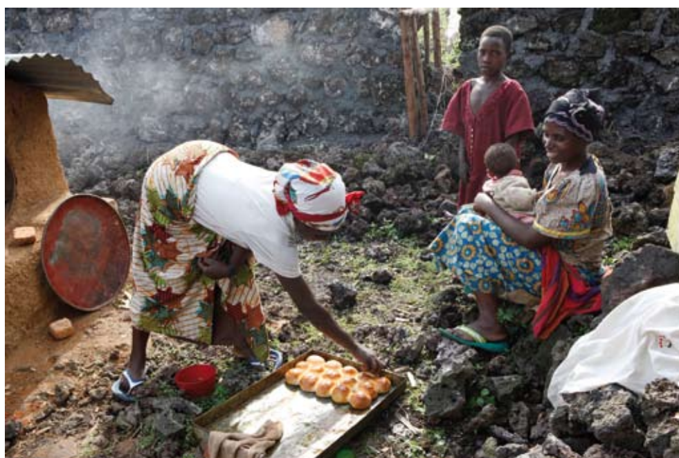
The PAIF project, which is supported by Medica Mondiale, encourages women to bake bread to earn a livelihood.

The participants mainly exchanged ideas and experiences relating to national action plans. Moreover, the interinstitutional EU Task Force on Women, Peace and Security was formed as an additional follow-up measure. The Task Force was charged with developing criteria for monitoring the implementation of the Comprehensive Approach. viii