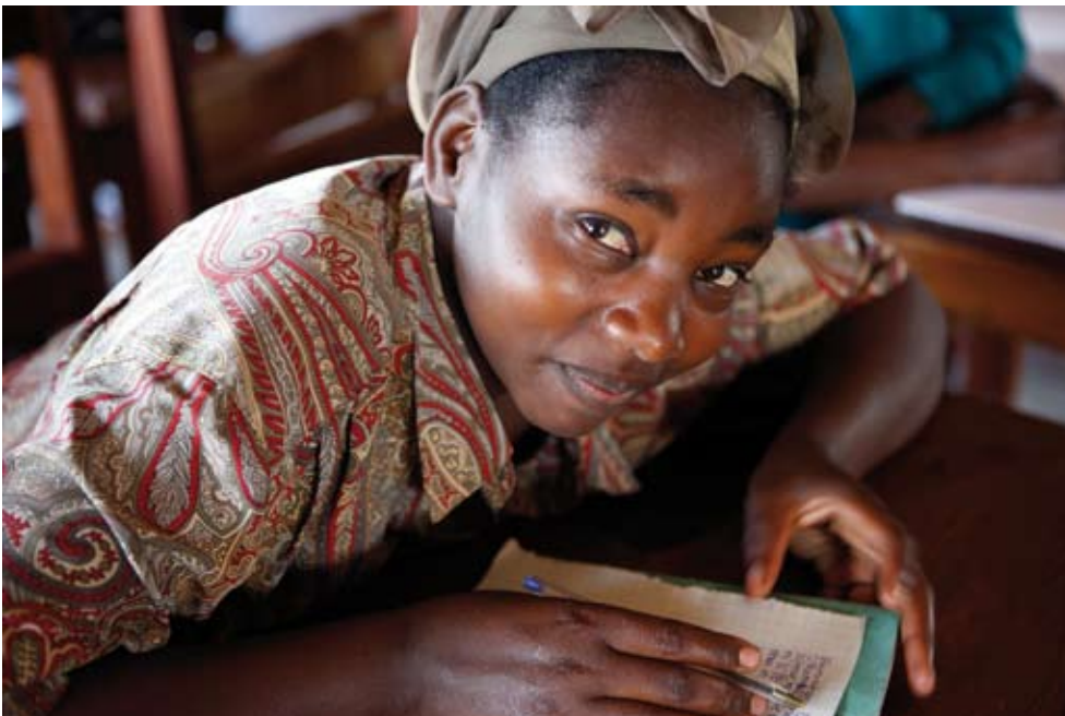
Medica Mondiale literacy courses teach women so that they can earn their own livelihood later on.